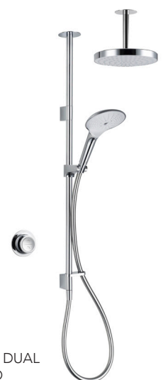
MIRA MODE DUAL REAR FED