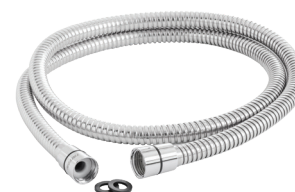
2m Anti-twist Hose - Chrome TSHG1266