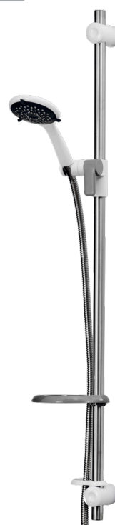
Omnicare Design Kit GAOMDF1

Replacing specified Triton accessories for this Omnicare unit will aid optimum performance and keep the unit within the allocated guarantee period