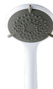
Inclusive Showerhead (5 Spray Pattern) TSHECAREWHT